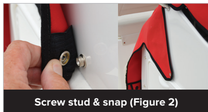
Screw stud & snap (Figure 2)