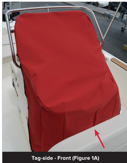
Tag-side - Front (Figure 1A)