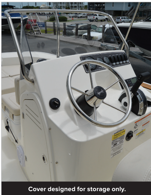
Cover designed for storage only.