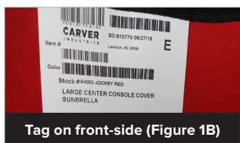
Tag on front-side (Figure 1B)