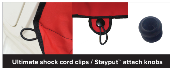
Ultimate shock cord clips / Stayput™ attach knobs