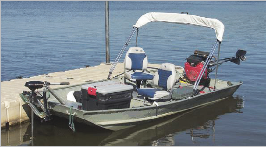
Brace kits sold separately.